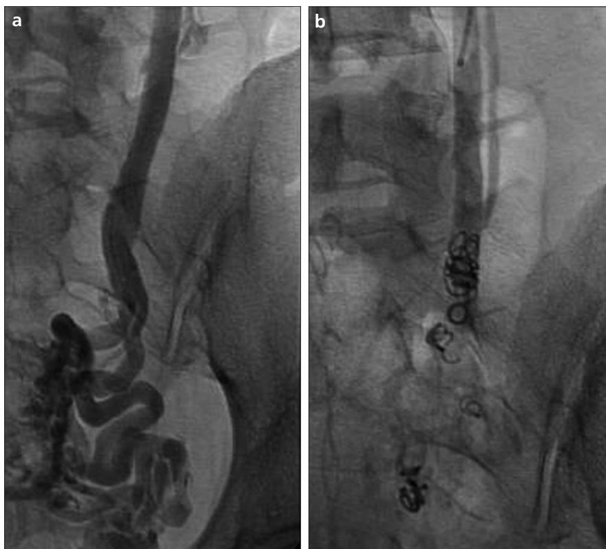
Figure 2. a, b. Venograms of Case 2 before (a) and after (b) embolization with steel coils. The left ovarian vein was dilated up to 11 mm and very tortuous (a). The vein was occluded after embolization (b).

doctrine evaluation. Proximal (isthmic) occlusion of uterine tubes was noted on hysterosalpingography. Abdominal ultrasound revealed left ovarian vein varicosis.